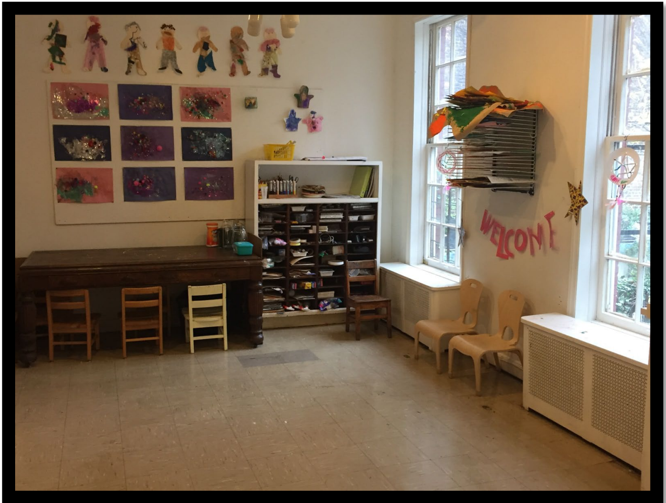
The Green Room 20 x 10 feet

The Green Room (which serves as an art room during school hours) is a very comfortable air-conditioned space adjacent to the stage. Ideal as a dressing room and greeting chamber. The Green Room also has a private bathroom facility and doors to the stage and foyer.