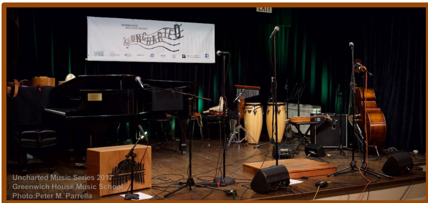
The hall set up for a typical concert